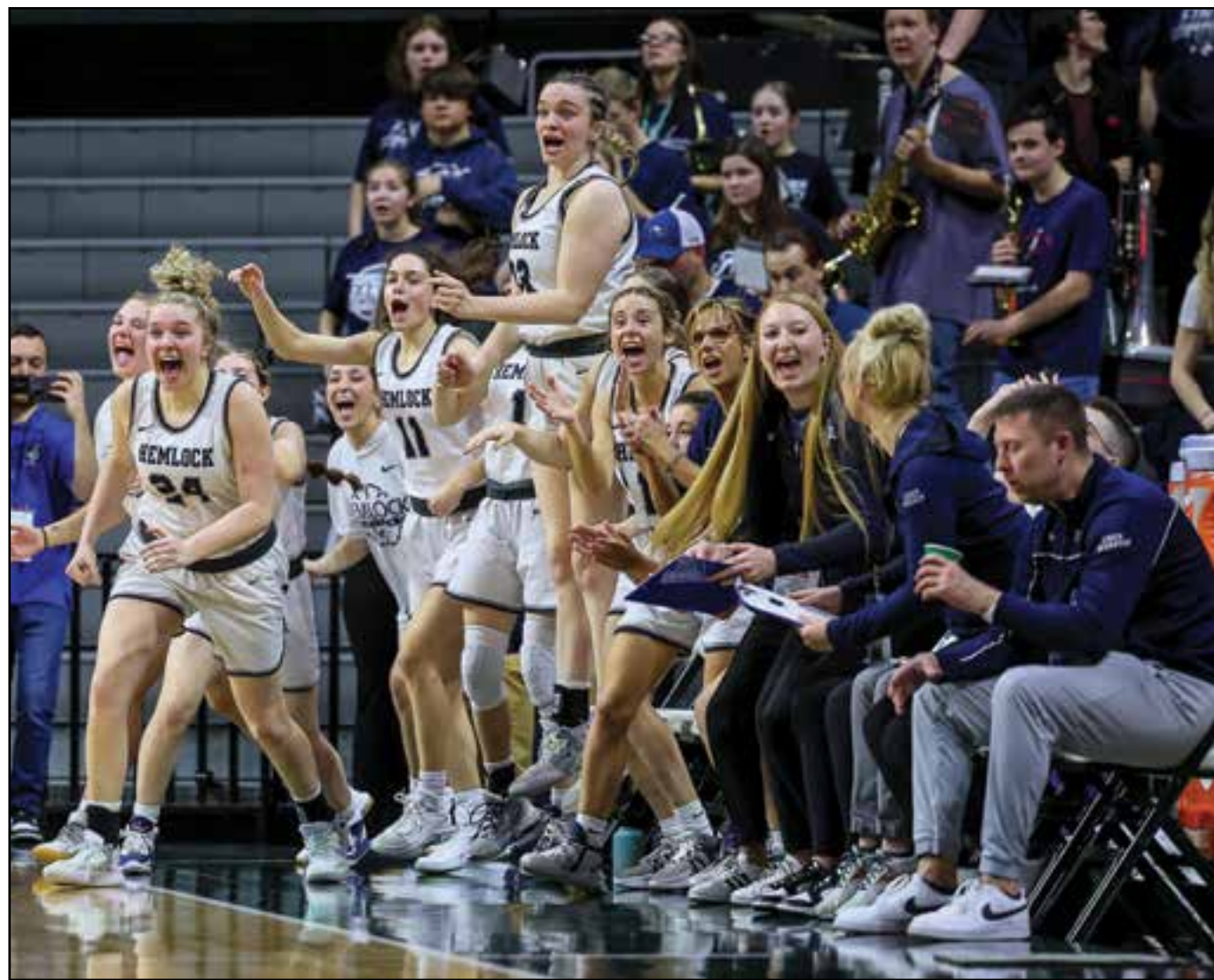
Hemlock won the 2022-23 girls basketball state championship.