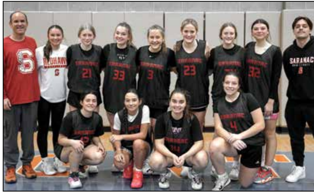
The Saranac basketball is counting on plenty of offseason work to pay off this year.