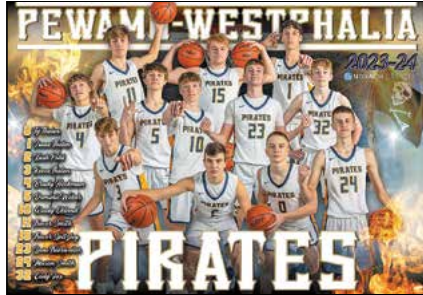
The 2023-24 Pewamo-Westphalia boys basketball team.