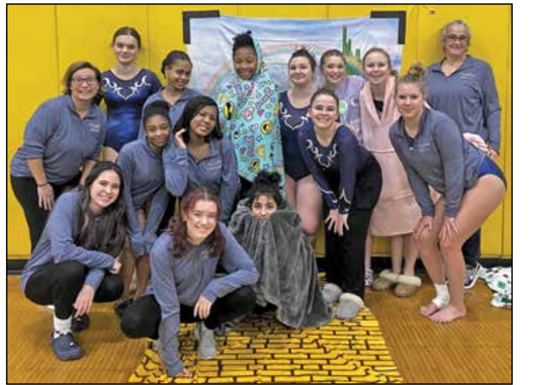
The combined DeWitt-East Lansing gymnastics team is looking for a solid season led by a number of talented gymnasts.

In the conference, long-time league powerhouse Grand Ledge will again be the