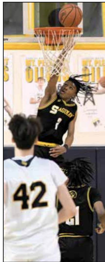
Look for plenty of action above the rim from some of the top area high school basketball teams this season.