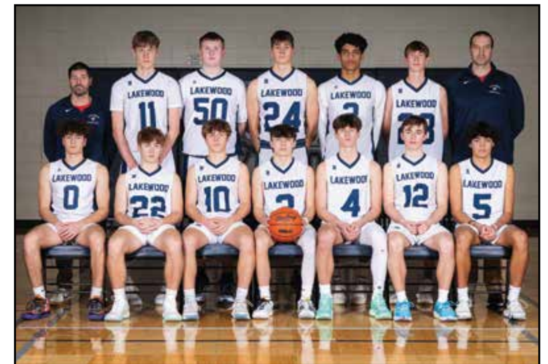
The Lakewood-Lake Odessa boys basketball team is counting on a total-team effort to make the difference this season.

"This team is fast, smart and can shoot," Solgat said. "They are also able to bring pressure. We need to work on taking care of the ball more and playing with more discipline. We need to work on