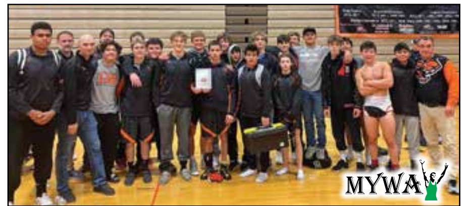
The Alma wrestling team has experienced plenty of success the past several years and the Panthers are poised to continue their winning ways this season.