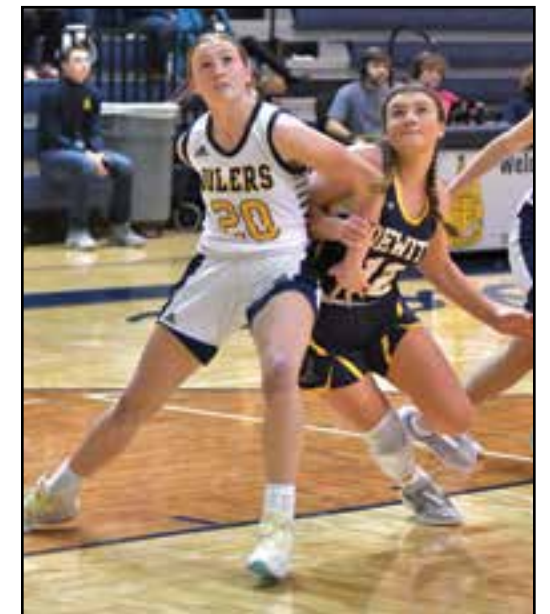
Mount Pleasant girls look to have another solid team this season.