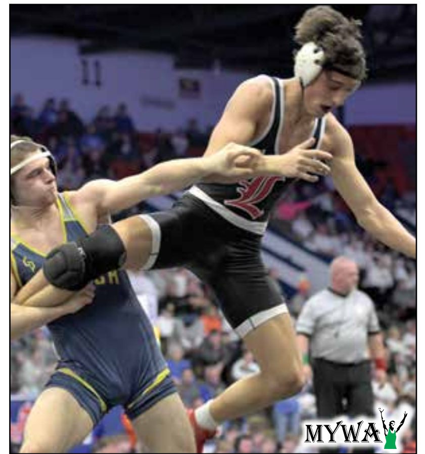
The Lowell wrestling team is taking aim at an 11 th straight team state championship this season.