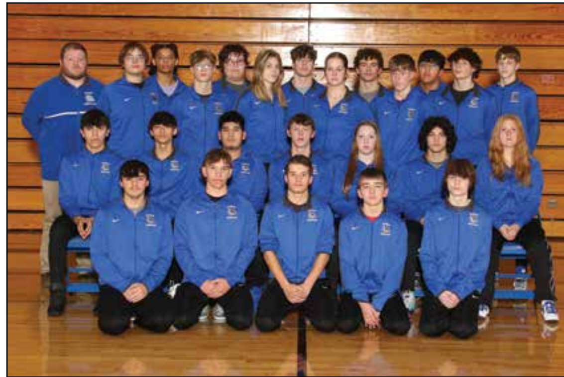
The 2023-24 Ionia boys and girls wrestling teams.

"Our league is tough and we added a couple new schools this season, Olivet and Lakewood, which only makes it tougher. It is very early in the season to tell but we will be working very hard to be in the race."