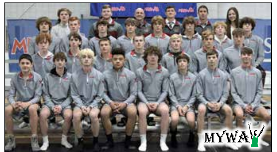
The 2023-23 Portland Wrestling team.