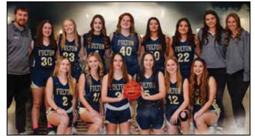
With several players back from a team that won 14 games last season Fulton-Middleton is positioned to make a run at the conference title.

defense and keeping good spacing on offense are some of the things the team is working on to improve.