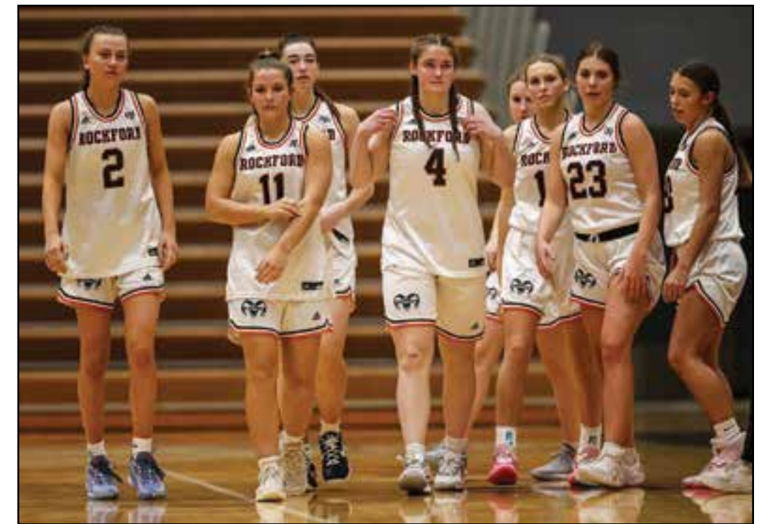
The Rockford Rams are gearing up to defend their Division 1 state title this season.

Rebuilding is the name of the game at Haslett where a large group of players from a team that went 22-2 last year have graduated. The Vikings will build around senior