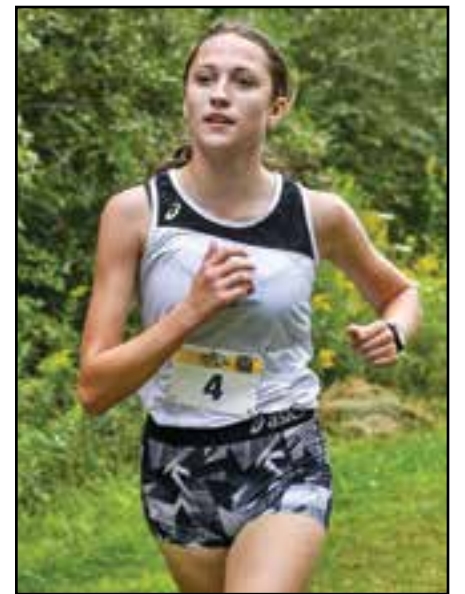
The Alma girls cross country team is ranked 14 th in the state in Division 2.