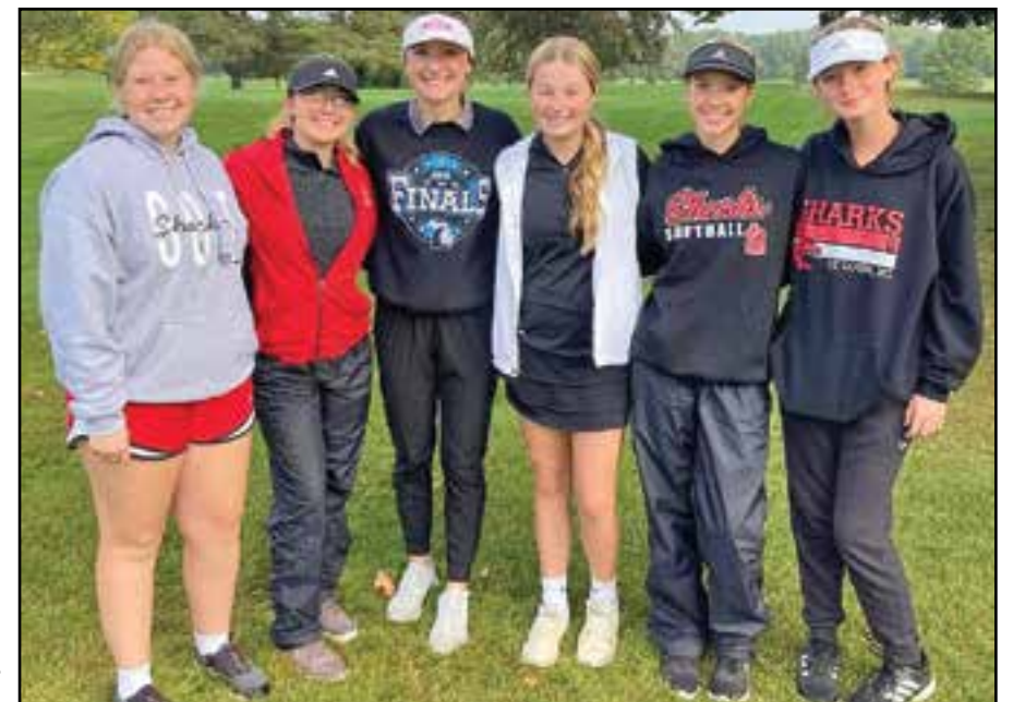
The St. Louis golf team is looking for more success this season after qualifying for state last fall.