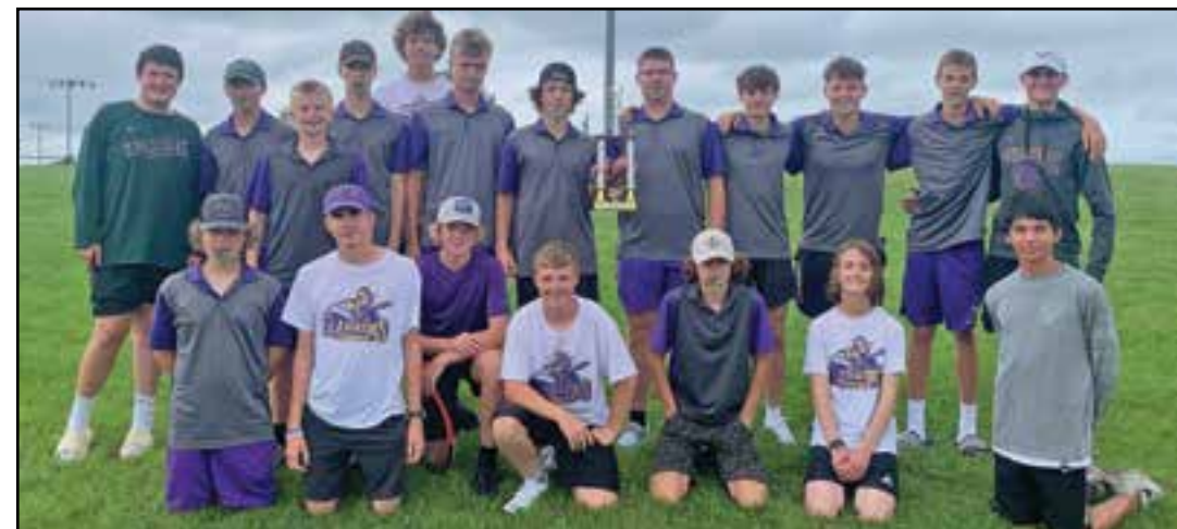
The 2023 Fowlerville Boys tennis team.

years on varsity and played 4 doubles last year.