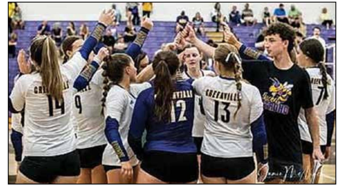
Greenville's volleyball team gets ready for a game.

"Our strength is definitely holding each other accountable," I