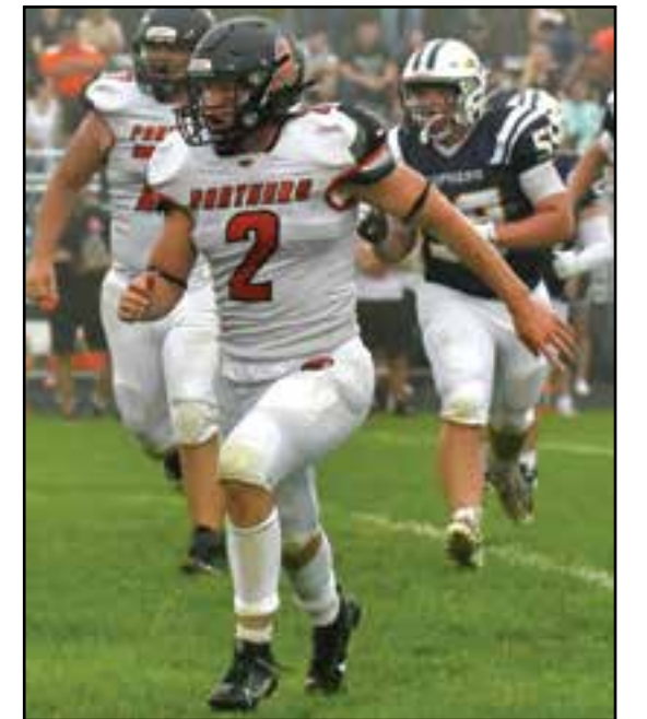
The Alma football team is receiving plenty of production on offense from a trio of athletes who have success in other sports at Alma.