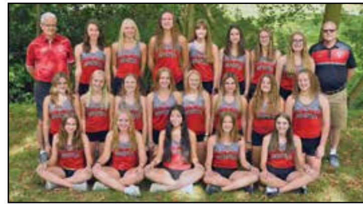
The 2023 Girls Cross Country team.

Expectations have been high. "Coach Hayes and I are looking for both the boys and the girls