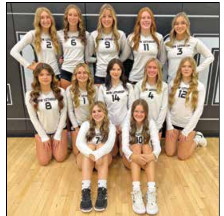
The 2022 New Lothrop volleyball team.

"Our conference is becoming stronger each year. I see the addition of youth programs in our communities strengthening our league. I think we will be in the running for top of the league this year."