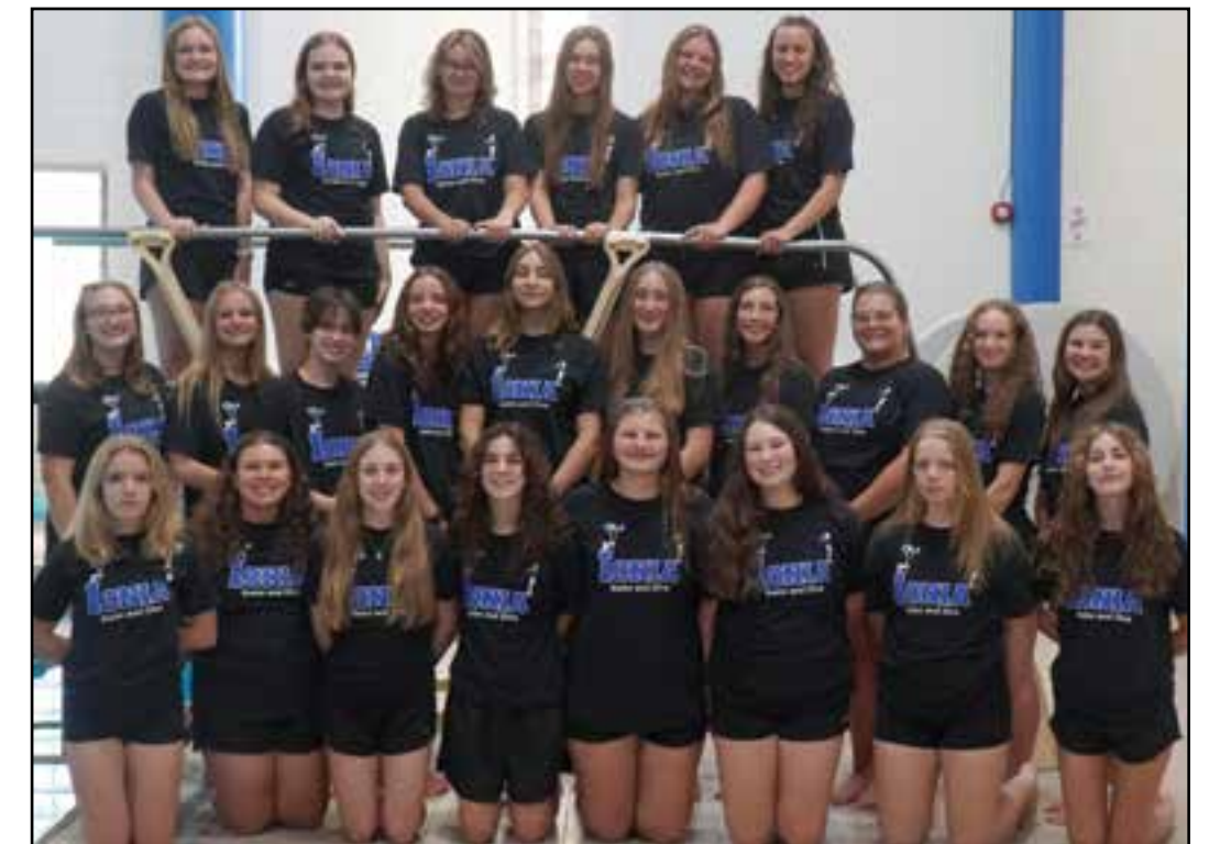
The 2023 Ionia Girls Swim Team.

"Our strength this year is in our numbers. Many teams are struggling to find athletes, and we have a big team. We also have more swimmers who are training in the off-season so that will help us compete in dual meets. Since we are so young, we are working on