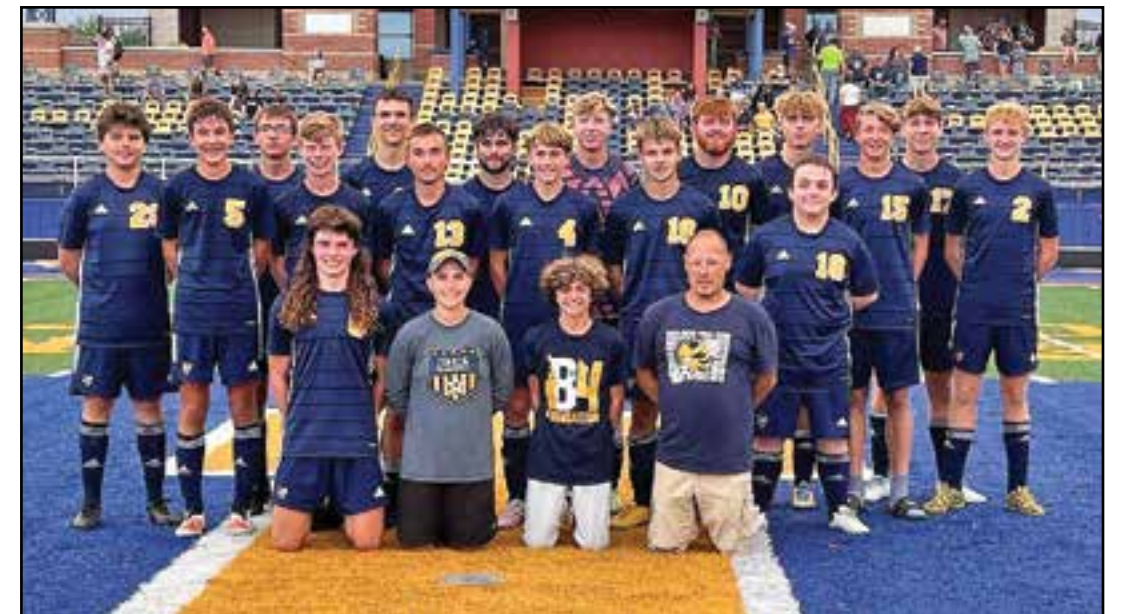
Ithaca hopes to win the conference soccer title