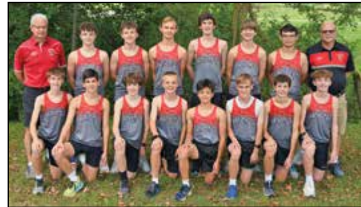
The 2023 Boys Cross Country team.