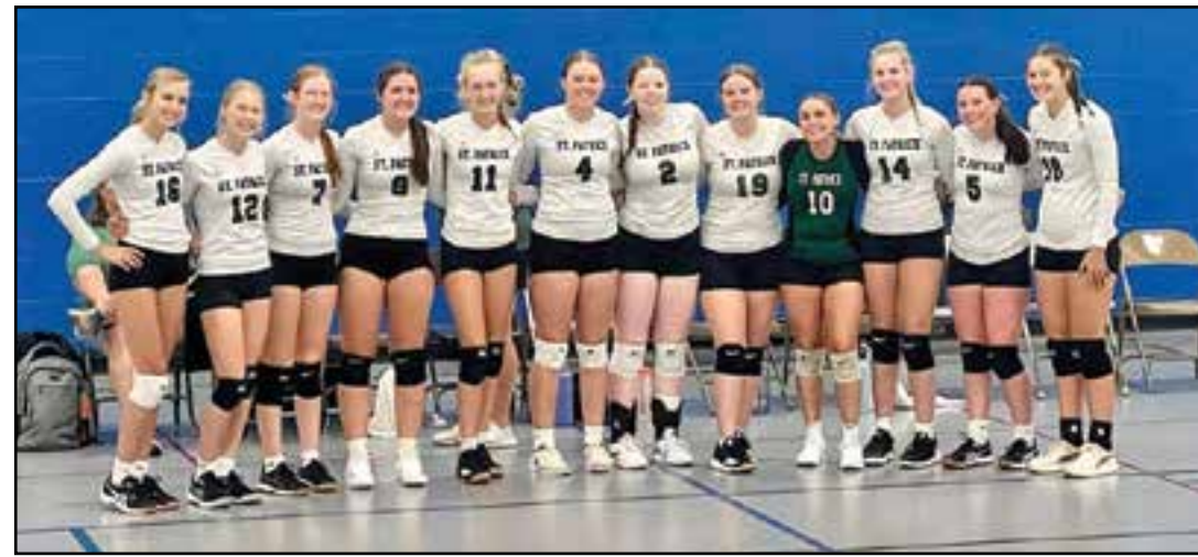
The 2023 Portland St. Patrick volleyball team.