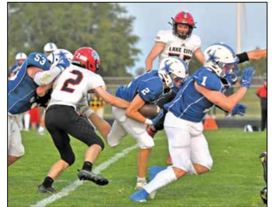
Beal City is third in playoff points in Division 8 this season and will be looking for a deep playoff run after reaching the Division 8 state championship game two years ago.

The Pirates have been a Division 7 powerhouse for several years and this season is no exception. Pewamo-Westphalia's lone loss this season came in week one when the