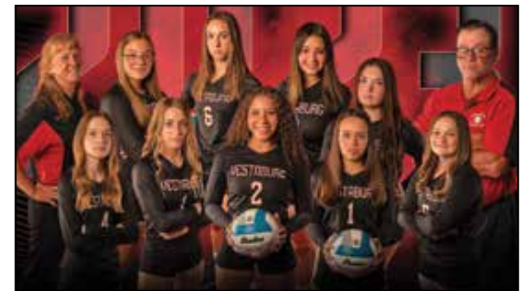
Vestaburg's 2032 Volleyball Team.

Sacred Heart also looks to be pretty strong and competitive as well. Again, our goal is to finish in the upper half of the league standings by the end of the year."