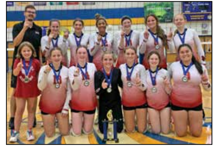
The 2023 Portland volleyball team.

overcome their lack of size with disciplined defense, and a speedy attack.