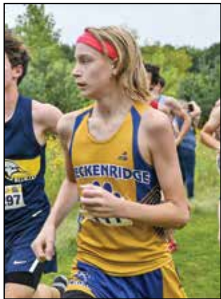
The Breckenridge boys cross country team is ranked 14 th in the state in Division 4.

The Ithaca girls cross country team placed 15 th at last year's state finals and the