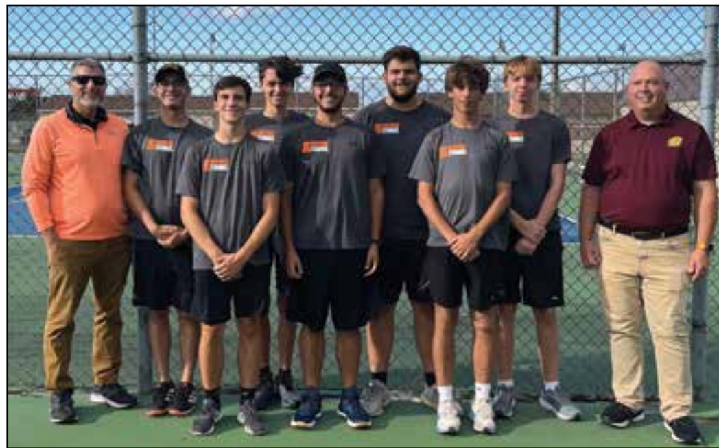
The 2023 Alma Boys tennis team.