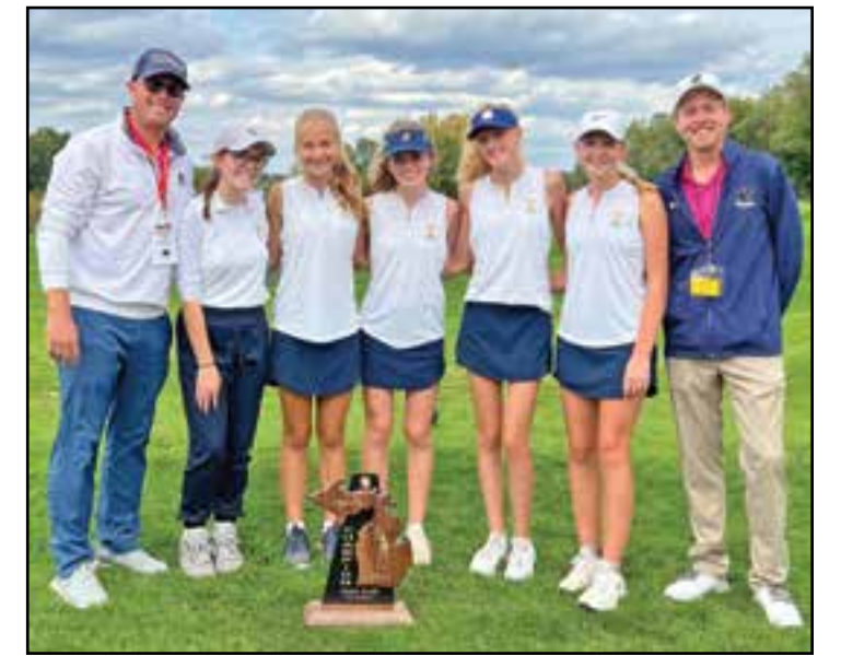
DeWitt golfers had a championship season in 2022.

"I am looking forward to seeing what these girls can accomplish."