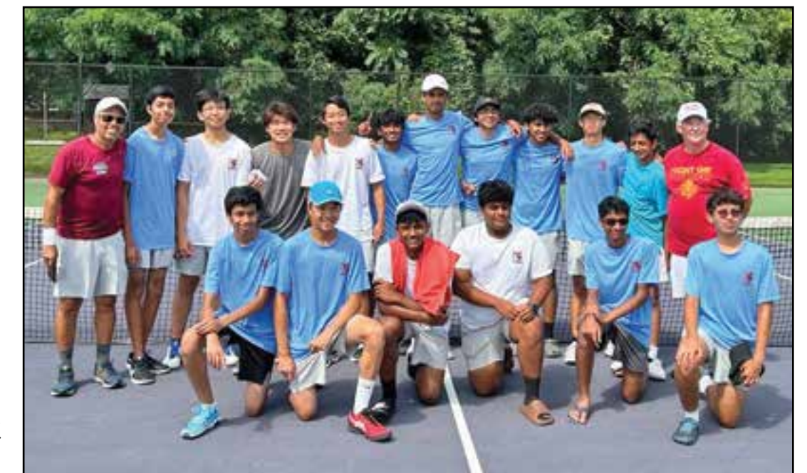
Okemos' 2023 boys tennis team.