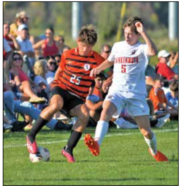
The Alma soccer team won its 11 th straight game with an 8-0 win against Frankenmuth.

With the regular season drawing to a close, Alma is primed to make another deep state tournament run. Alma will play in the Division 3 district tournament at Shepherd. Among the main challengers facing the Panthers at the district will be Clare and Reed City who both have winning seasons this fall along with Howard City Tri-County which has been playing .500 soccer this season. Host Shepherd has also been hovering around the .500 mark this season setting up for a wide-open district tournament that the Panthers look to be favored at.