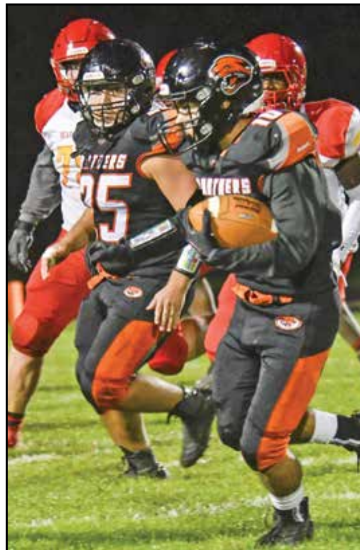
The Alma football team will be counting on the senior class to lead the way this season.