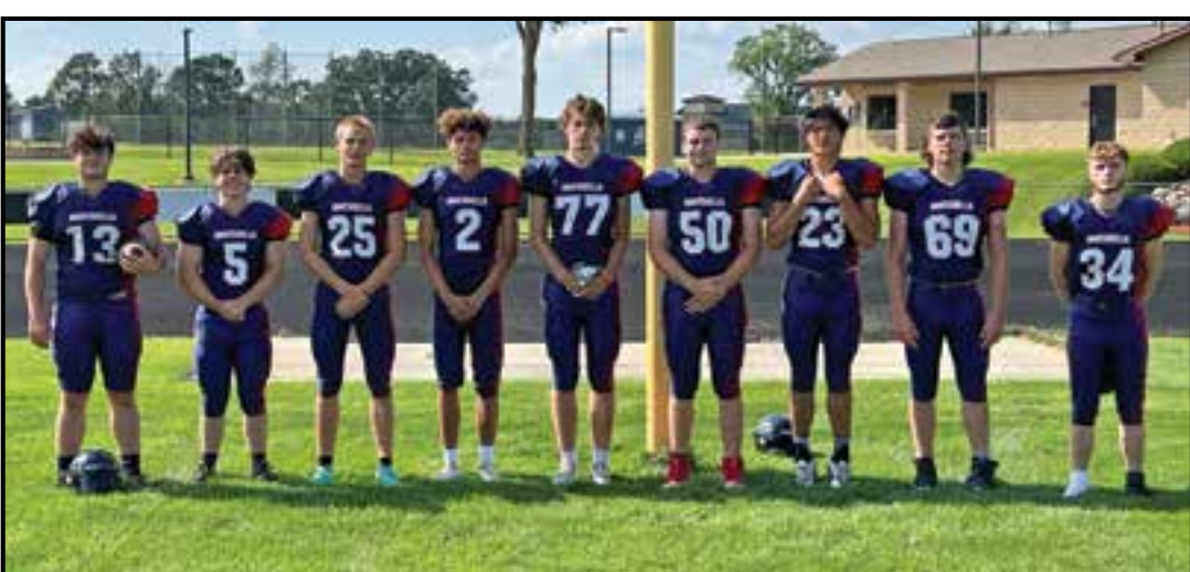
Montabella's seniors will play a key role for the football team.