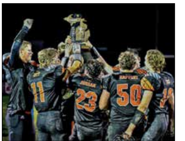
The Merrill football team hand a season for the ages in 2022 recording 10 wins and scoring a school-record 560 points.