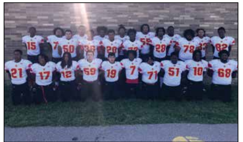
The Bridgeport football team hopes to be contender this season.

considerable, and recent playoff runs. This fits well with our team's day-day mantra."