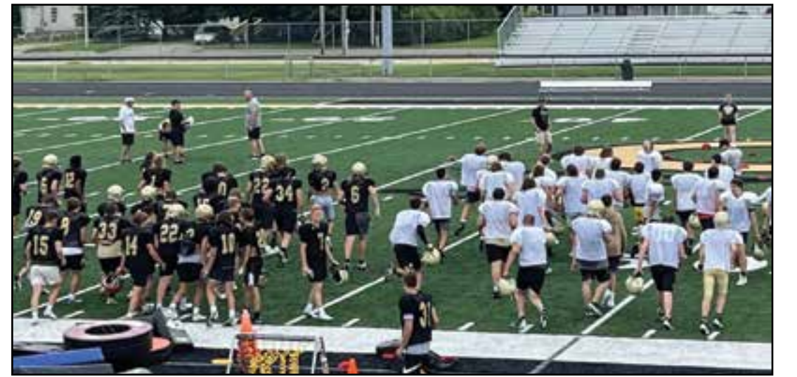
The Corunna football team put in plenty of work during the summer and is ready for a big season.

Mixing in with the veterans are some talented newcomers. Junior