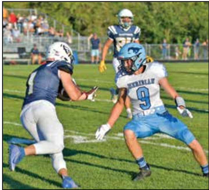
The Shepherd football team moves to the Jack Pine Conference this season.