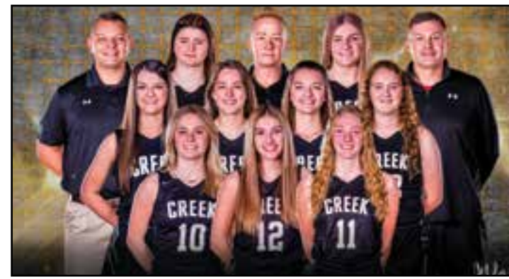
The 2022-23 Midland Bullock Creek girls basketball team.