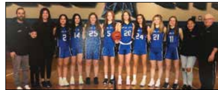
The 2022-23 Beal City girls basketball team.