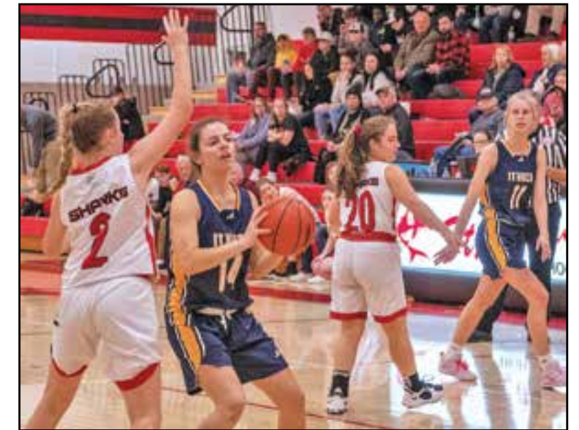
Ithaca is one of several area basketball teams ranked in the state in Division 3 or 4 this season.

have started the season with a few rough spots, but they have been on a tear since.