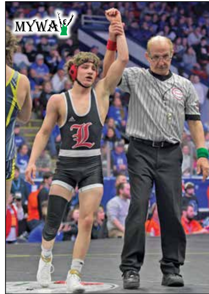
The Lowell wrestling team will be looking to raise their hands in victory for a tenths straight state title.