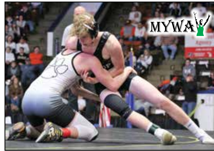
New Lothrop will be looking to knock off Hudson against in this year's Division 4 state team finals.

Like Lowell, the Davison wrestling team takes on any challenge it can find. Ranked third in the state in Division 1, the