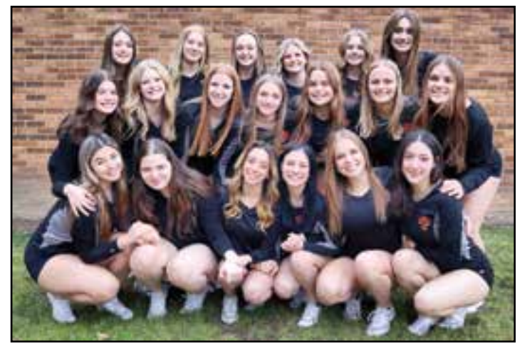
The 2022 - 2023 Alma Cheer Team.