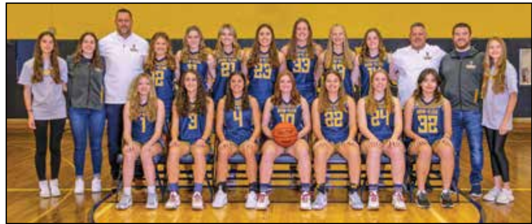
The Ovid-Elsie girls varsity basketball team.