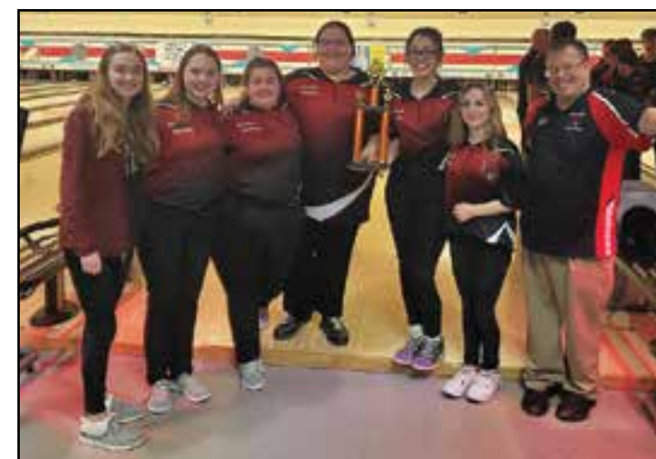
The 2022-23 Portland bowling team.