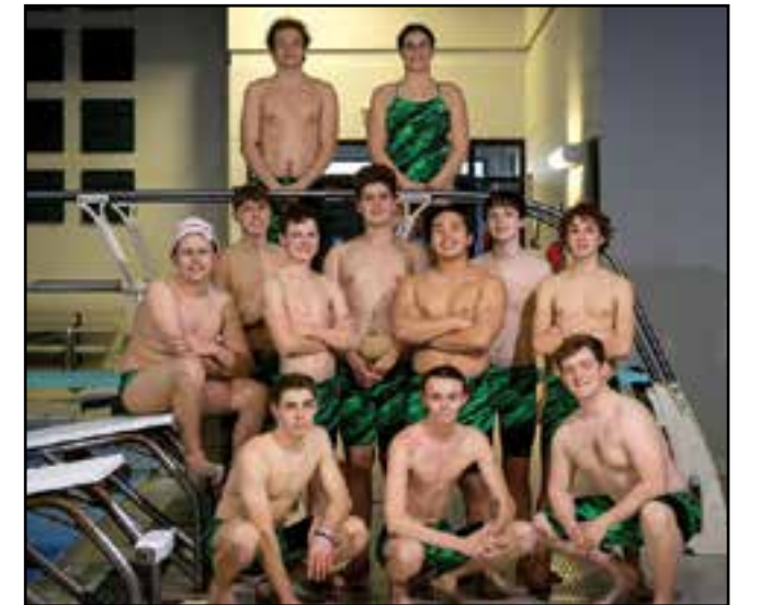
The 2022-23 Williamston/Lansing Catholic swim and dive team.

really is. Being able to secure 6th place out of 11 teams really opened the team's eyes to how solid of a team they are."