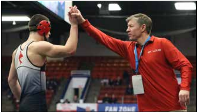
The St. Louis wrestling team qualified for team state and reached the semifinals.

The St. Louis wrestling team turned in one of its finest seasons in years. The Sharks defeated Hesperia 54-20 to win the regional title and make its their first trip to the team state finals since 1995. St. Louis then defeated Decatur 53-18 in the quarterfinals before falling to eventual state champion Hudson in the semifinals.