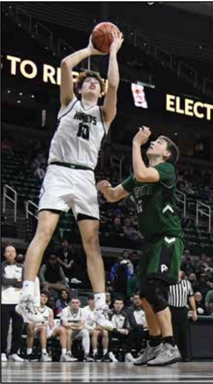
The Williamston boys basketball team won the first boys basketball state title since 1940.

During the winter, along with the Hornet boys winning a state basketball title the Williamston girls basketball team and the wrestling team both won district crowns.