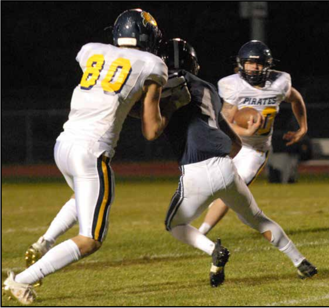
The Pewamo-Westphalia football team won a second straight state football championship last fall.

Pewamo-Westphalia has a winning tradition in the sport of competitive cheer and this year's squad added to that legacy. The competitive cheer team qualified for the state finals and finished sixth in the state at the Division 4 state finals.