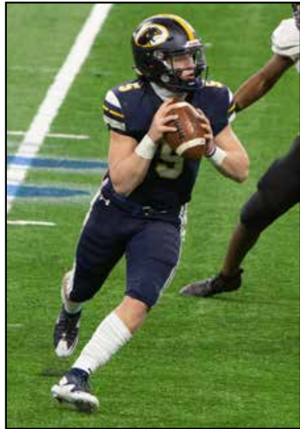
The DeWitt football team reached the Division 3 state championship game.