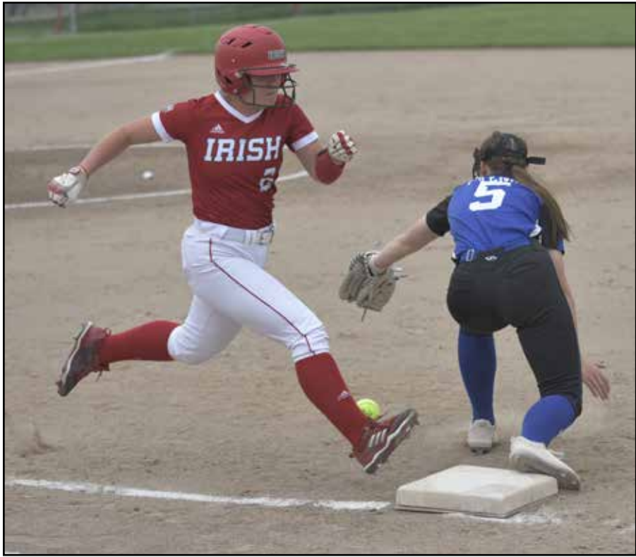
The Mt. Pleasant Sacred Heart softball team reached the Division 4 state semifinals.