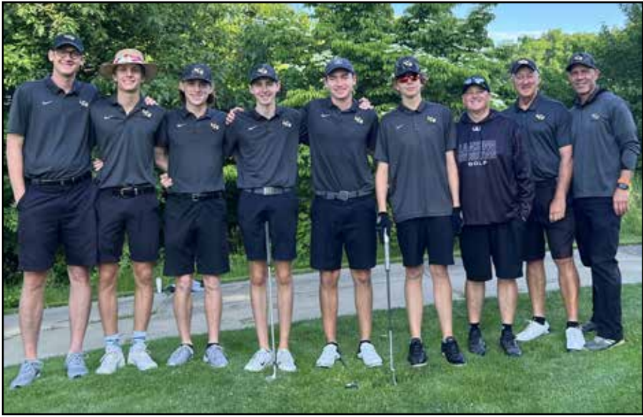
The Lansing Christian boys golf team won the Division 4 state title.