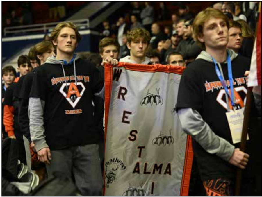
The Alma wrestling team reached the Division 3 team wrestling finals for the first time in program history.

After advancing to the state semifinals the previous two seasons, the Alma wrestling team reached the top of the mountain as it wrestled nationally-ranked Dundee for the Division 3 team state championship. Alma, which ended the season with a 28-2 record, came up short in the championship match as it was unable to keep Dundee from winning a fifth-straight D3 state crown.