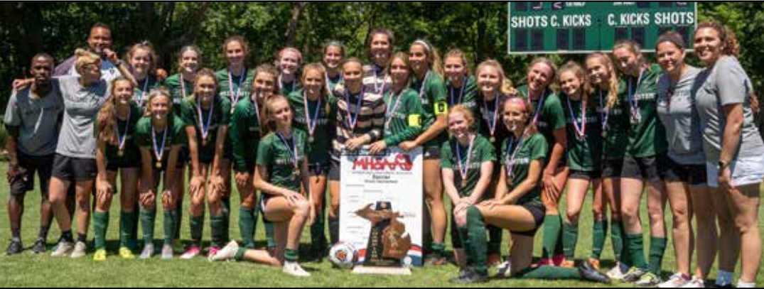
The Williamston girls soccer team won a state championship for the first time in program history.