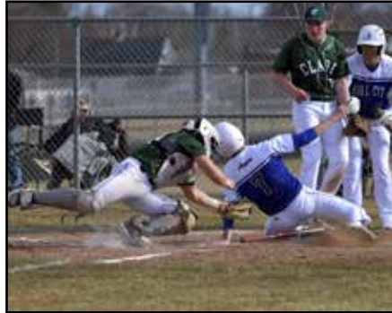
The Beal City baseball team set a record for runs scored this season.

The Lansing Catholic boys track team won its second state championship in the last 10 years as it edged Saugatuck for the Division 3 state title by a single point. The state title was the second for the Cougars who won the state title in 2012.