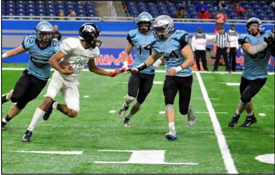
The Lansing Catholic football team won the Division 6 state title.

With an opportunistic and stingy defense leading the way, the Lansing Catholic Cougars won the Division 6 state football championship. The Cougars forced five turnovers in the title game to outlast Warren Michigan Collegiate in a defensive struggle. The title was the third overall for Lansing Catholic and the second in the past three years.